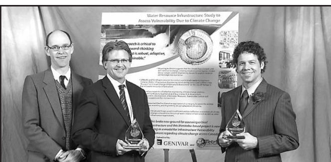
Environmental Award of Merit presented to GENIVAR & TetrES Consultants Inc. for the Portage la Prairie Water Resource Infrastructure Study to Assess Vulnerability due to Climate Change.