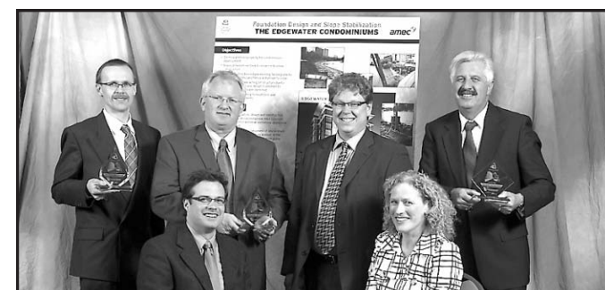
Building Engineering Award of Merit presented to AMEC Earth & Environmental and Crosier Kilgour & Partners Ltd. for the Edgewater Condominiums.