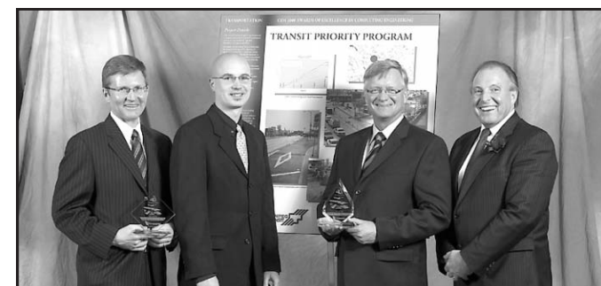
Infrastructure/Transportation Award of Merit presented to Dillon Consulting Limited for the Transit Priority Program City of Winnipeg Transit Department Project