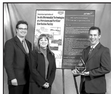
Environmental Award of Excellence presented to AMEC Earth & Environmental for the Innovative Application of In-Situ Bioremediation Technologies at a Petroleum & Fertilizer Distribution Facility - Gladstone, MB