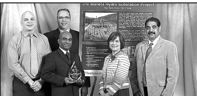
Energy Resource Development Award of Excellence presented to Teshmont Consultants LP for the Waneta Hydro Substation Project.