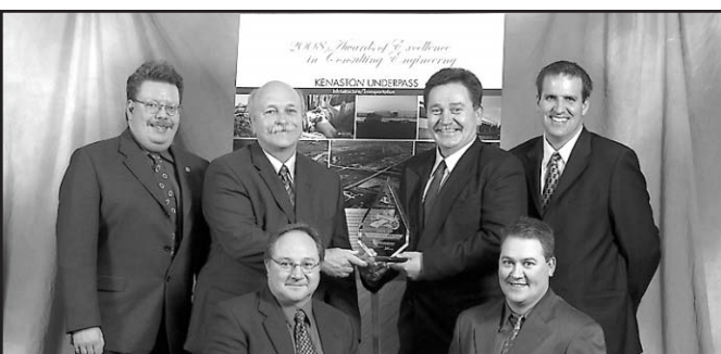
KEYSTONE AWARD - STANTEC CONSULTING LTD. Infrastructure/Transportation Award of Excellence winners and Keystone Award Recipients for the Kenaston Underpass