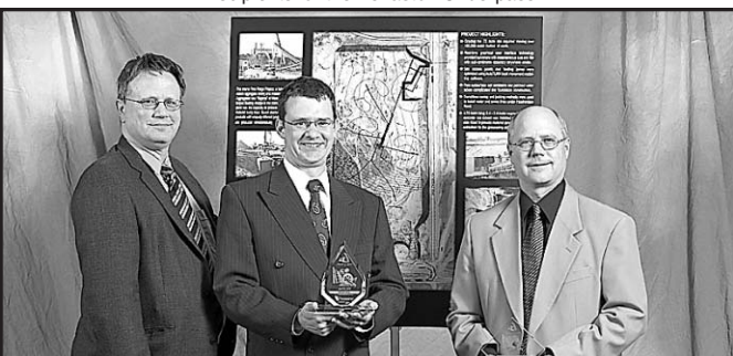
Industrial Category Award of Merit was presented to KGS group for the Inland Pine Ridge Project