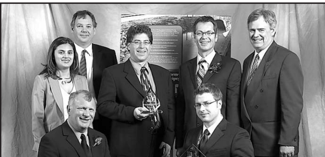
Municipal & Water Technology Award of Merit presented to Earth Tech (Canada) Inc. for Stormwater Management for the Winnipeg Airport Authority Development Project.