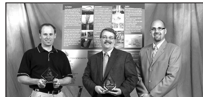
Building Engineering Award of Merit presented to Crosier Kilgour & Partners Ltd for the Parking Structure Assessment and Rehabilitation at 415 Edison Avenue and 1301 Rothesay Street Project