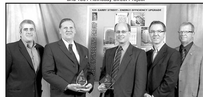
Building Engineering Award of Merit is presented to the Tower Engineering Group LP for the 125 Garry Street Energy Efficient Upgrade Project.