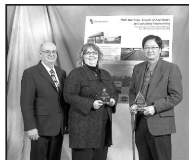
Infrastructure/Transportation Award of Merit presented to UMA Engineering Ltd for the CN Overpass on Trans Canada Hwy (TCH) #1 West - Portage la Prairie By-Pass